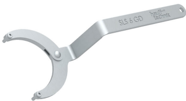
Flexible socket wrench