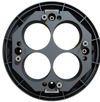
ETGAR wall sleeve for building services outlet