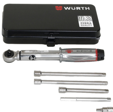
Assembly set for HSI150 DG/HRK SSG