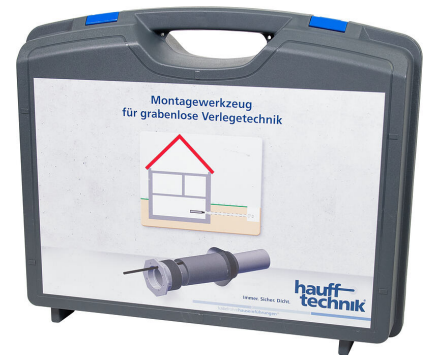
Assembly kit MIS NoDig