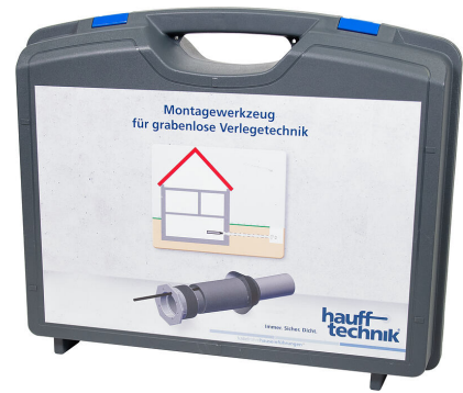
Assembly kit MIS NoDig