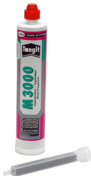
2-component resin M3000