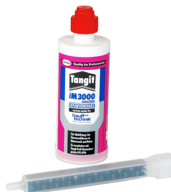
2-component resin iM3000