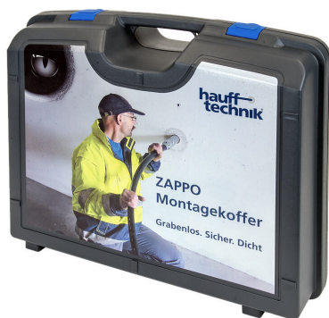
ZAPPO assembly kit