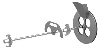
Compound injection unit