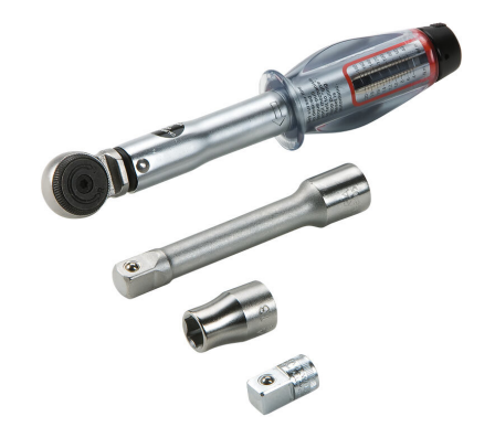
Toolset for KES-M