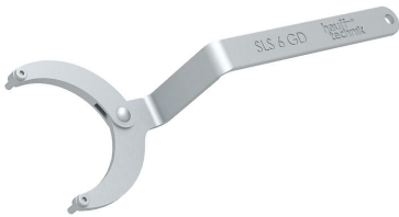
Flexible socket wrench