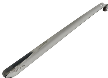
Assembly plate for fire-stop pads