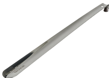
Assembly plate for fire-stop pads