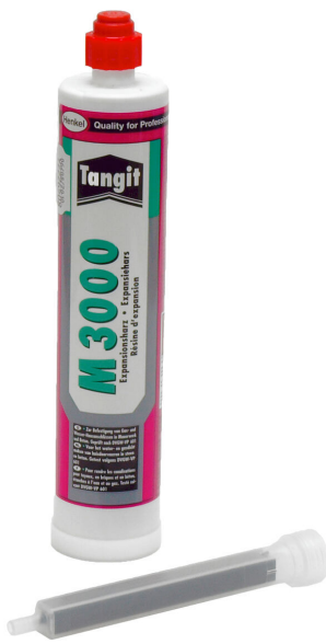
2-component resin M3000