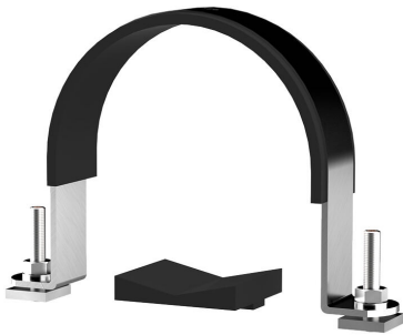
Fastening bracket 160