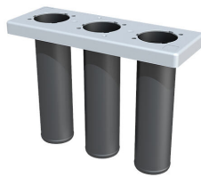
Seal insert for basic insert