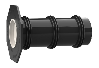
Universal wall sleeve