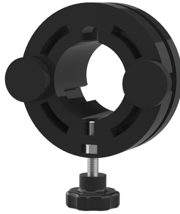
Quick tensioning device