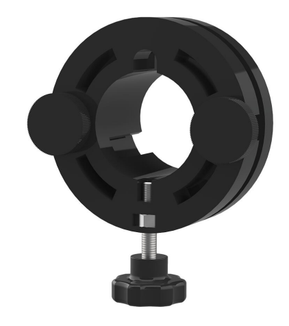
Quick tensioning device