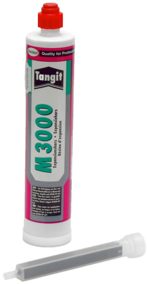
2-component resin M3000