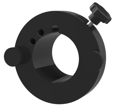
Quick tensioning device