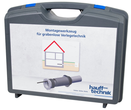
Assembly kit MIS NoDig