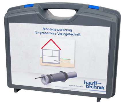
Assembly kit MIS NoDig