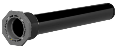
Basic variant with inner seal