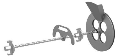
Compound injection unit