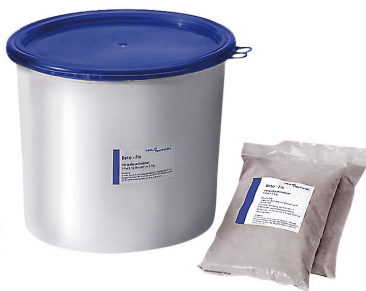
Hauff - Beto - Fix void-filling mortar