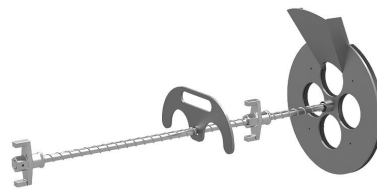
Compound injection unit