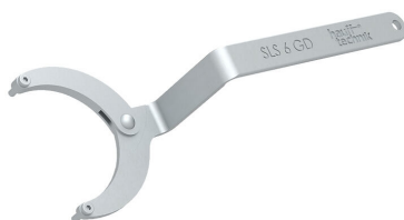
Flexible socket wrench