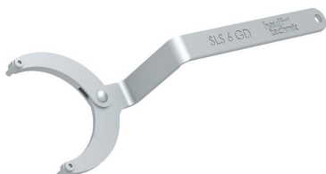
Flexible socket wrench

Socket diameter: 32 Number of cables/medium: 3 Area of application cable OD (mm): 19-30