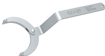
Flexible socket wrench

Socket diameter: 20 Number of cables/medium: 6 Area of application cable OD (mm): 14-18