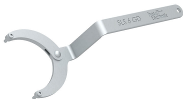
Flexible socket wrench