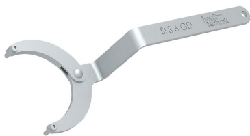
Flexible socket wrench