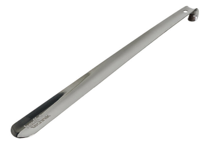
Assembly plate for fire-stop pads