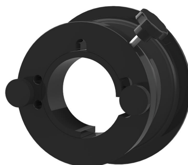
Quick tensioning device MIS