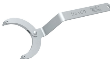
Flexible socket wrench