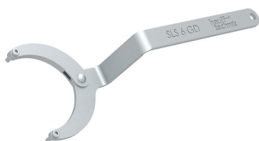
Flexible socket wrench