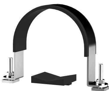
Fastening bracket 160