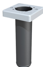
Seal insert for basic insert