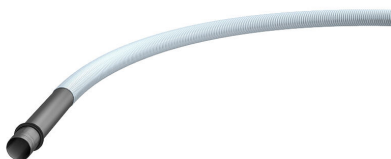
Spiral hose system