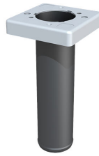
Seal insert for basic insert