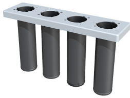
Seal insert for basic insert