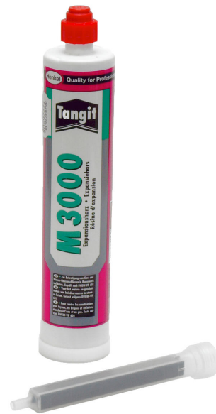
2-component resin M3000