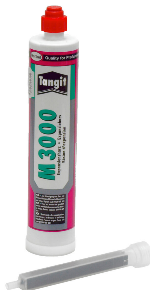
2-component resin M3000