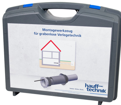
Assembly kit MIS NoDig