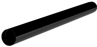
ZAPPO driving pipe