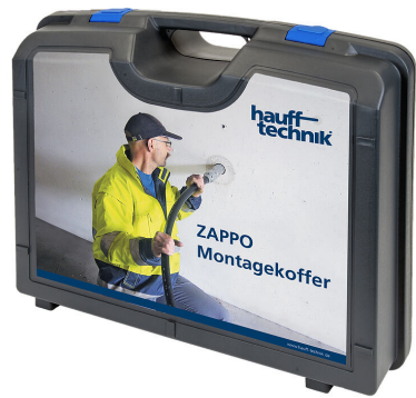
ZAPPO assembly kit