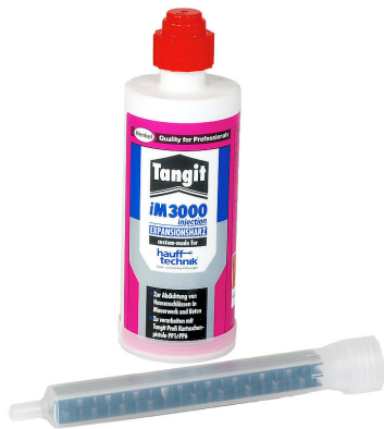
2-component resin iM3000