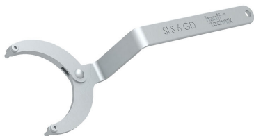
Flexible socket wrench