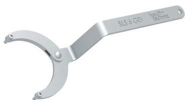
Flexible socket wrench