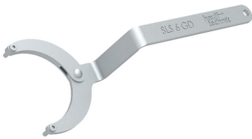
Flexible socket wrench