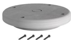
ETGAR carrier plate