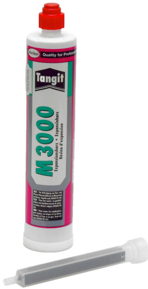
2-component resin M3000