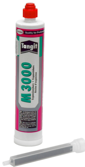
2-component resin M3000