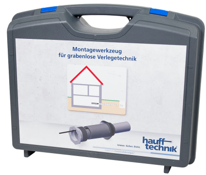
Assembly kit MIS NoDig