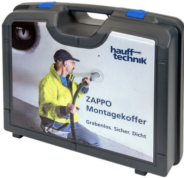
ZAPPO assembly kit