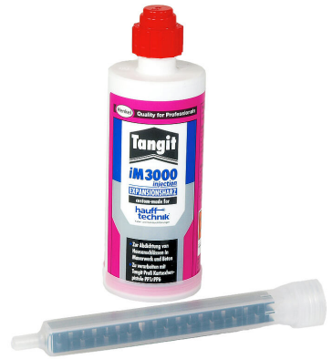
2-component resin iM3000