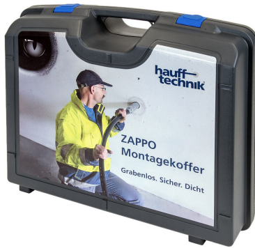
ZAPPO assembly kit