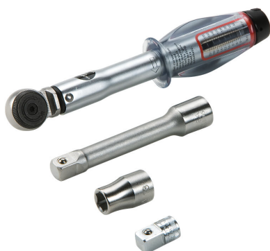
Toolset for KES-M

Number of cables/medium: 6 Area of application cable OD (mm): 8 - 36