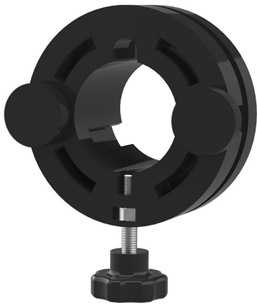
Quick tensioning device