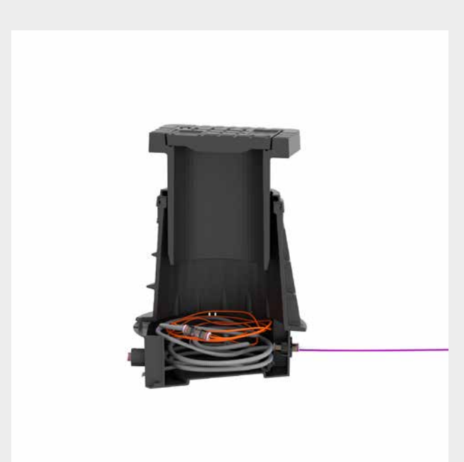
2LINE G-BOX as storage location / transfer point