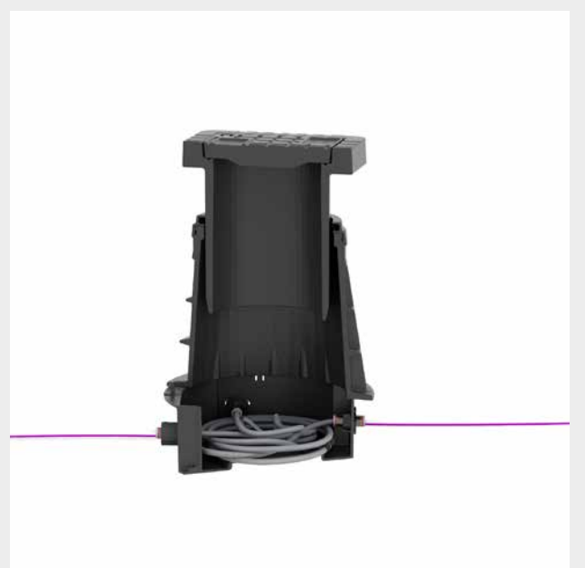
Household connected without excavation work in public spaces