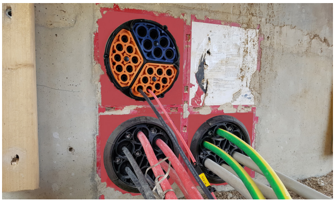
HSI 150-DG and Segmento