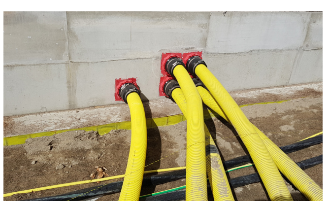
Duct connection with HSI 150 rubber sleeves