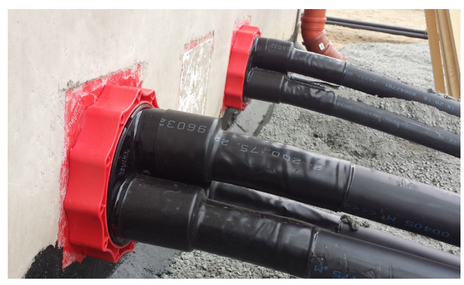
Underground cables sealed with shrink technology