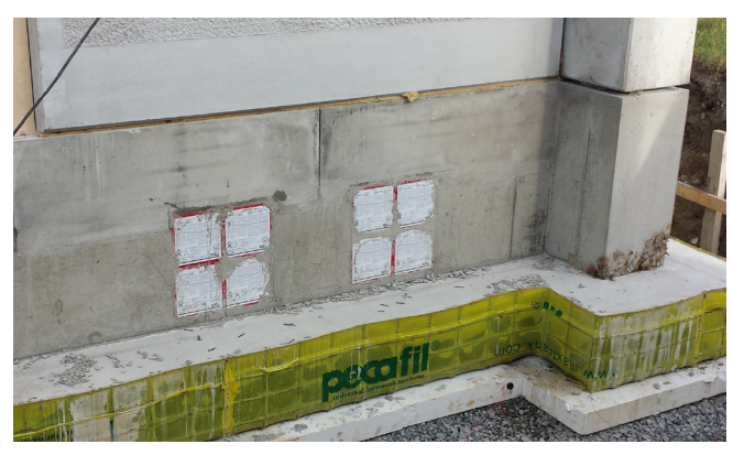
HSI 150 wall inserts