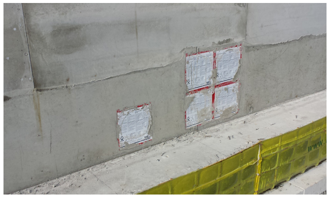
HSI 150 wall inserts