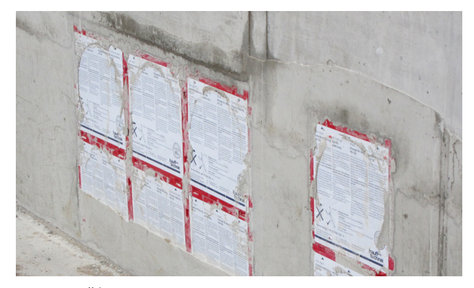
HSI 150 wall inserts