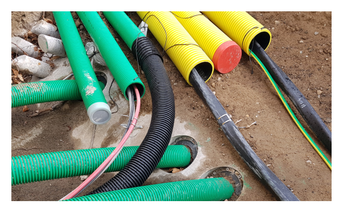
ADS to seal ducts inside core drills