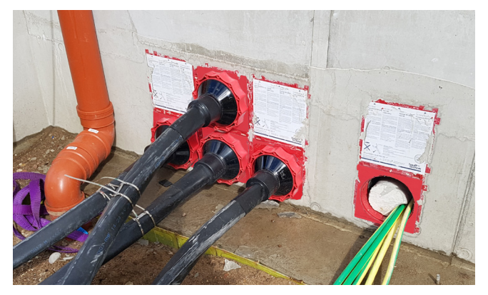
Underground cables sealed with shrink technology