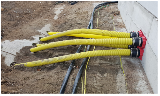
Duct connection with HSI 150 rubber sleeves