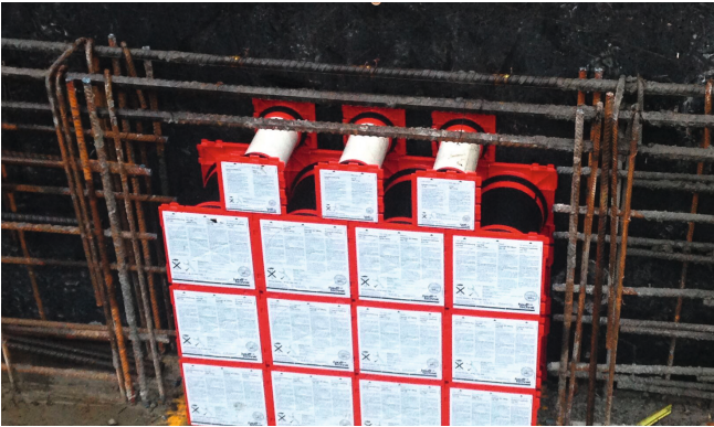
HSI 150-K2 and HSI 90-K2 wall inserts mounted in formwork