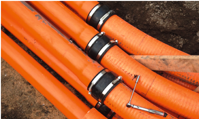
Connection sleeves between rigid and Hateflex spiral hose