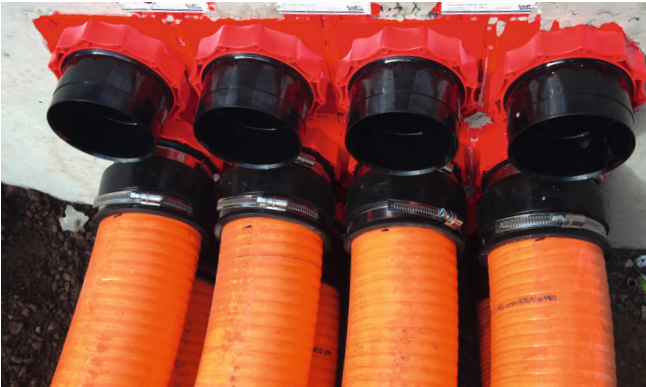
Connection of Hateflex spiral hose using KES 150-D system cover