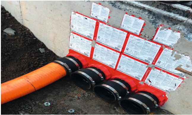
Connection of Hateflex spiral hose using KES 150-D system cover