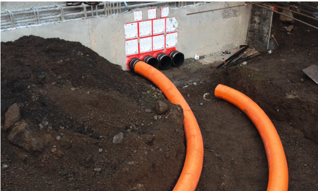
Hateflex spiral hose 5.3 m lengths