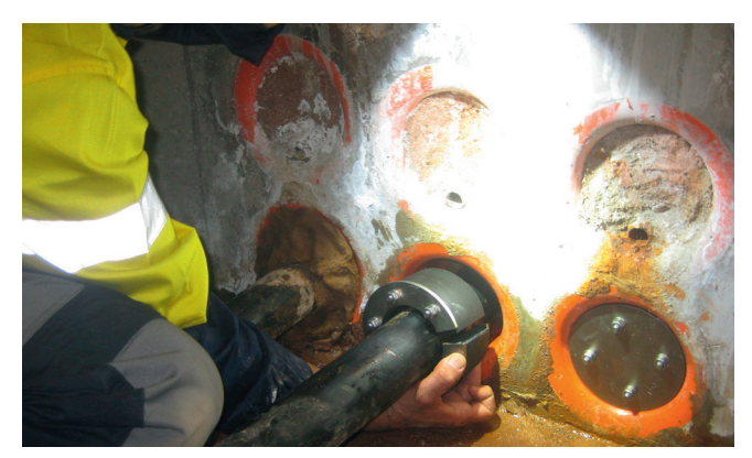
Installation of press seal