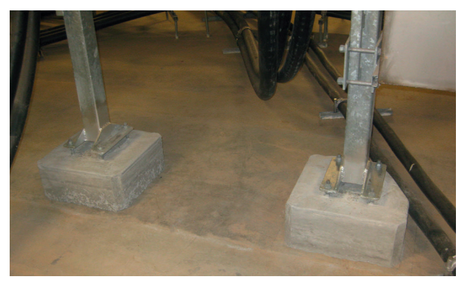
Concrete footings installed to raise steel works off water level