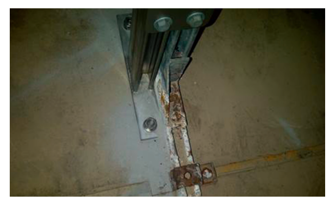
Passive fire protection materials washed out of the penetrations and water damaged the steel footings